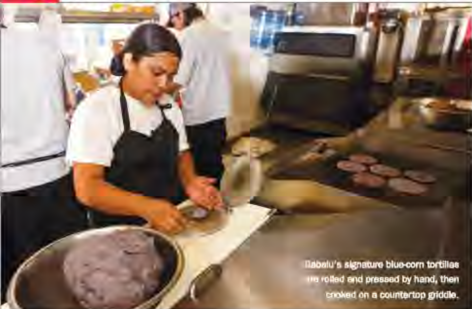
Babalu's signature blue-corn tortillas are rolled and pressed by hand, then cooked on a countertop griddle.

company favors electric over gas—and employing newer technologies, such as fast-cook microwave/convection ovens, combis, induction and sous vide.