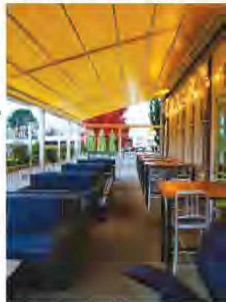
Babalu’s patio seating can be used nearly year-round thanks to its retractable sides and roof paired with patio heaters and air conditioning.

“The roof at our Jackson restaurant is powered by a German motor, and the sides go up and down using an Italian motor,” Latham says. “This alfresco dining setup cost us a lot, but it’s been worth it. People like the open air. If the sun gets too hot, we can drop the roof. If it’s windy out, we can pull down the sides. We’ve had an incredible guest response from this space.”