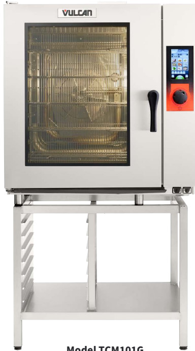
Model TCM101G Shown on optional stand