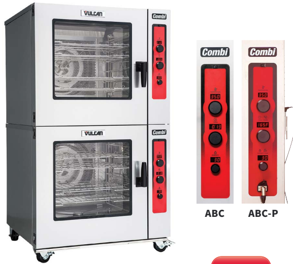
Model ABC7E Shown stacked