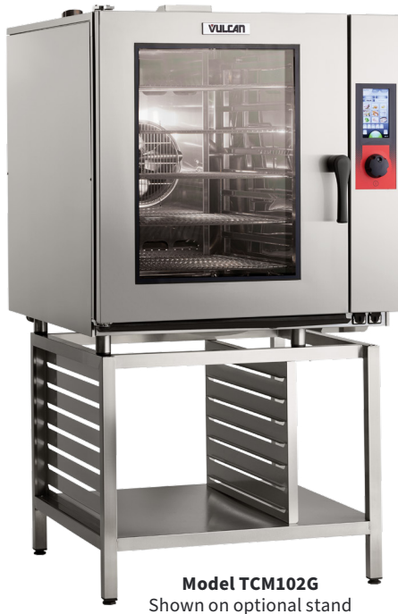
Model TCM102G Shown on optional stand