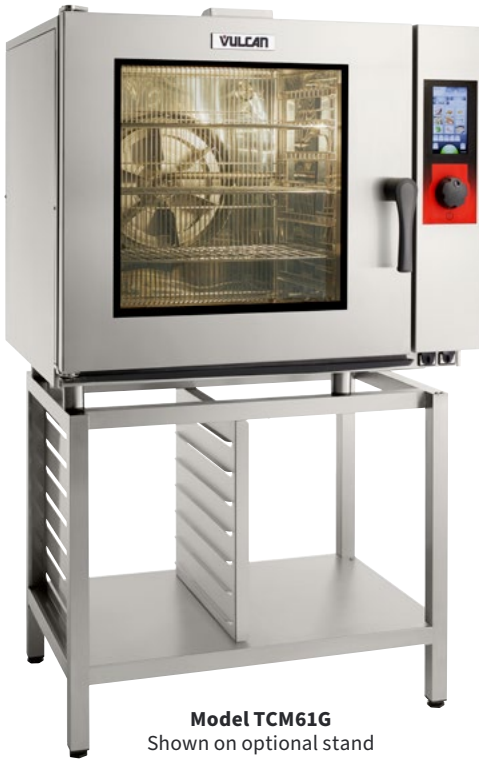
Model TCM61G Shown on optional stand