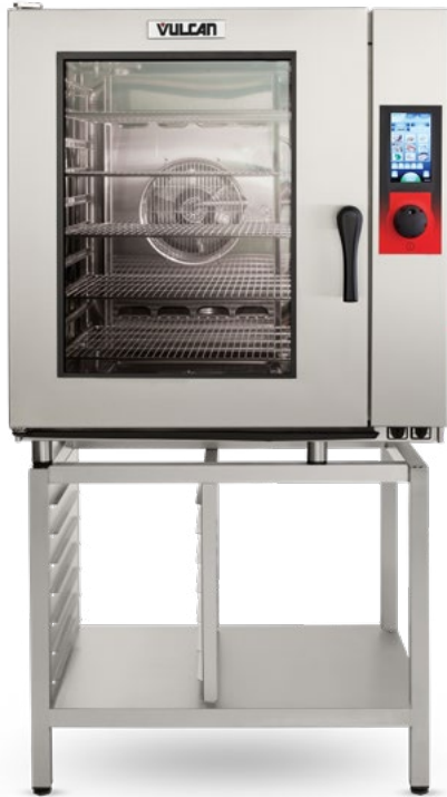
Model TCM101G Shown on optional stand