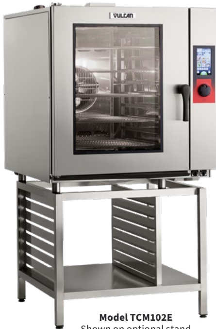
Model TCM102E Shown on optional stand

TCM102E – Electric Boilerless Combi Oven