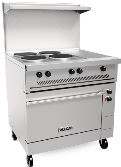
Model EV36-S-4FP-1HT-208 shown with optional casters