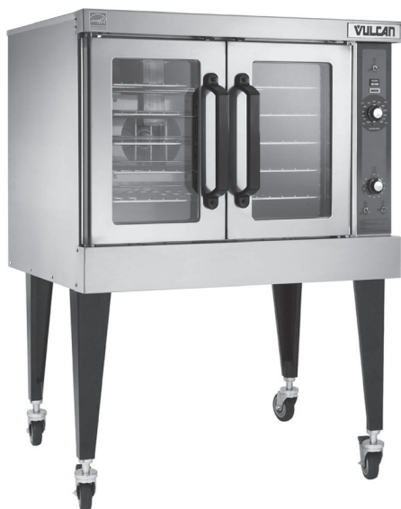
Model VC6GD Shown on optional casters