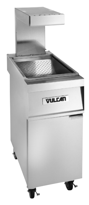
Frymate VX15 shown with optional ThermoGlo™ Food Warmer