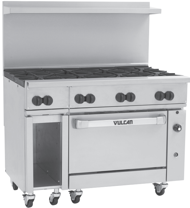
Model 48S-8BN (shown with optional casters)