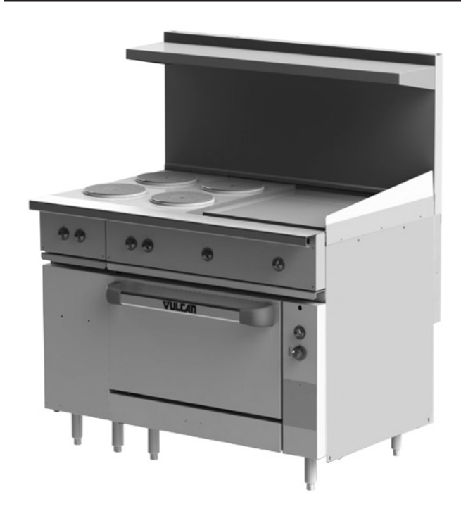
Model EV48S-4FP24G208 shown with adjustable legs