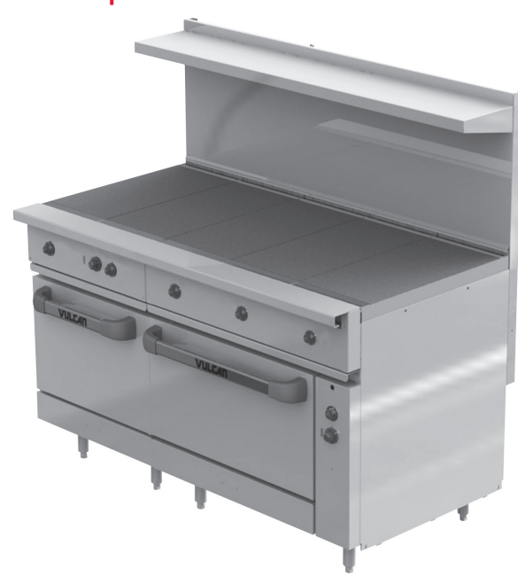
Model EV60SS-5HT208 Shown with adjustable legs