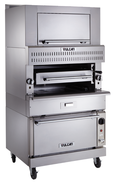
Model VBB1SF (shown on a standard oven base and optional casters)

Ceramic Radiant Upright Broilers 36" Wide Gas Range