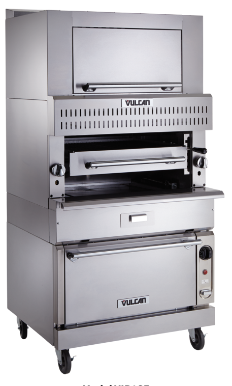
Model VIR1SF (shown on a standard oven base and optional casters)

Infrared Upright Broilers 36" Wide Gas Range