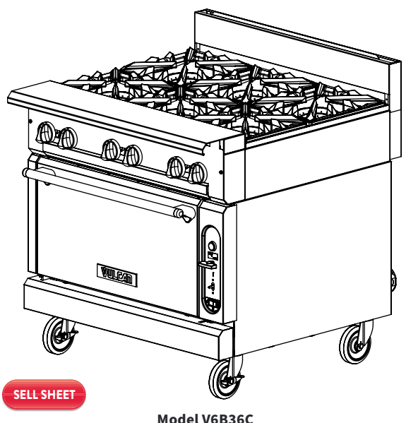
Model V6B36C Shown on a convection oven base