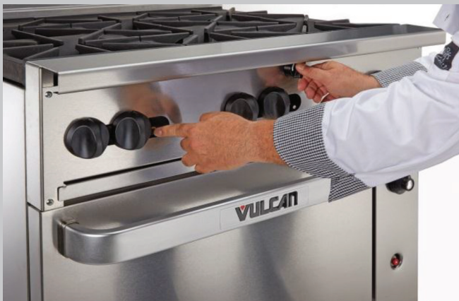
Press-n-Click Piezo Ignition

→ Flexible platforms available to meet your menu requirements.