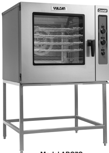
Model ABC7G (shown on stand)