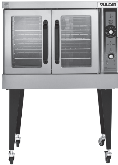
Model SG4 Shown on optional casters