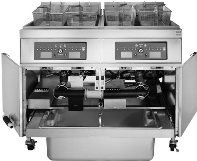
Model 2ER85CF Shown on casters (Accessory)