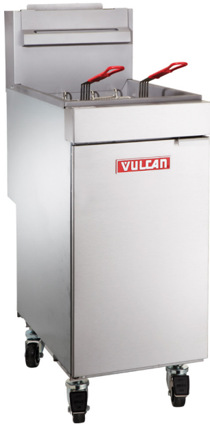
Model LG300 Shown with caster accessories