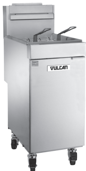
Model 1VEG35M Shown with caster accessories