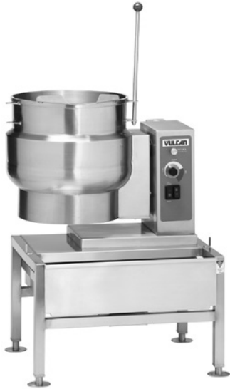
Model K12ETT shown with accessory stand