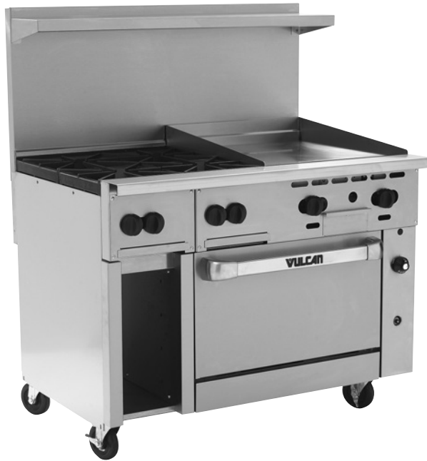
Model 48S-4B24GN (shown with optional casters)