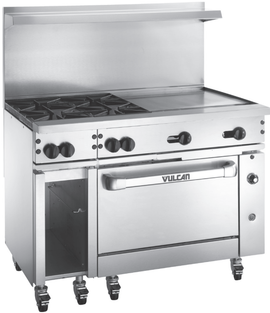
Model 48S-4B24GN (shown with optional casters)