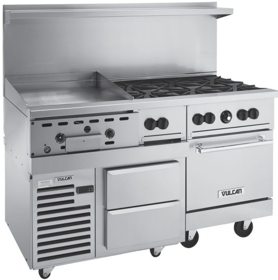
36R shown in a 60" configuration