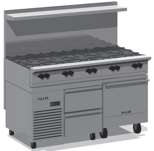
36R in a 60" Setup