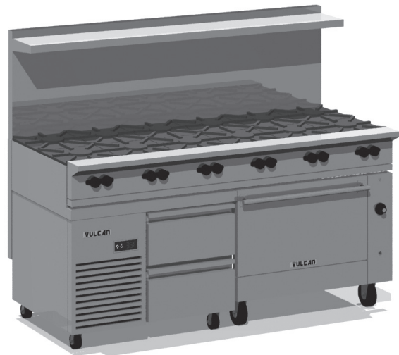
36R in a 72" Setup