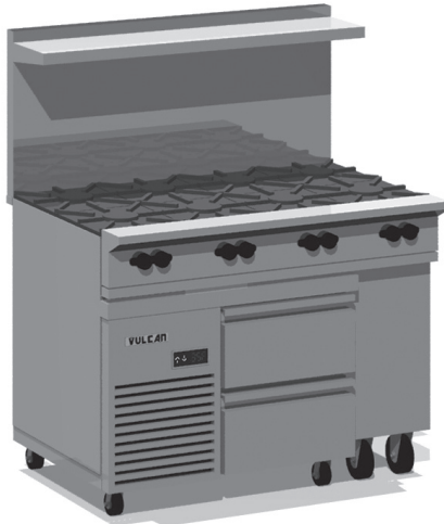
36R in a 48" Setup