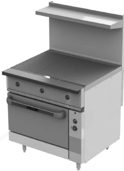
Model EV36S-3HT208 shown with adjustable legs