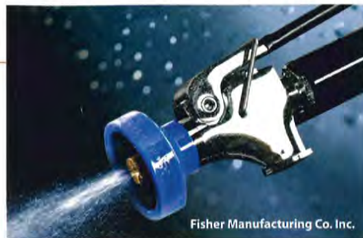
Fisher Manufacturing Co. Inc.