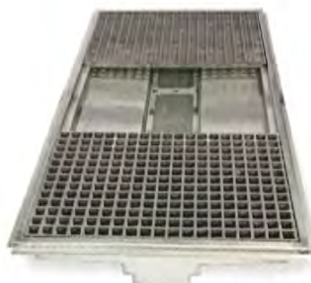
Made to Drain