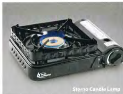
Sterno Candle Lamp